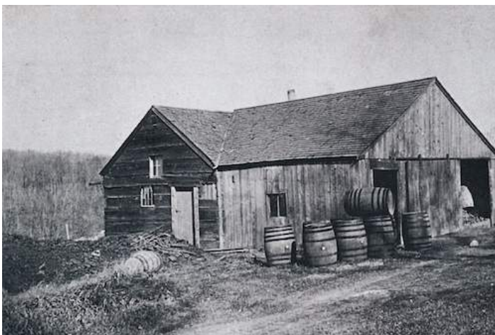
The cider house was used for cider making in the early twentieth century. Located just to the east of the large store, it is now gone.