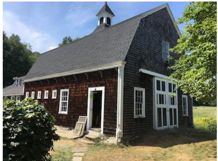
The gambrel-roofed barn.