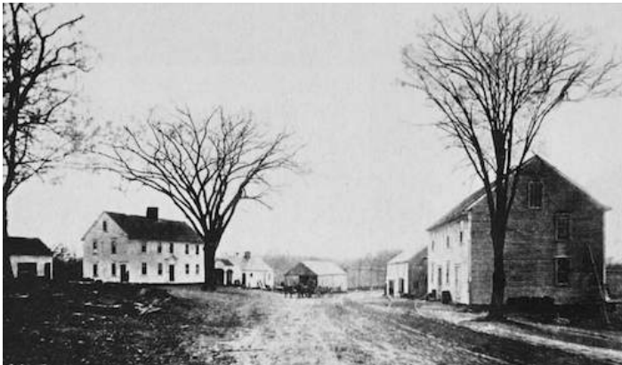
The Mathewson farm in the 1890s, looking west along Greenville Avenue. The cooperage can be seen here just to the right of the house, and to the right of that is a drive-through shed. To the left of the house is a blacksmith shop. On the north side of the street is a large store that had a hall on the second floor where dances and shows were held.

This past summer, one of the iconic old farm properties in Johnston was put up for sale, that being the Mathewson Farm, located at the end of Atwood Avenue, where it meets Greenville Avenue. The farm, with its old farm house, magnificent barn, silos, and open fields has been a landmark in the Belknap section of town for over 250 years. During that time the property was owned by the Mathewson family, and only in this past summer of 2020 did it finally change hands. It is hoped that the new owner will be able to maintain the historic integrity of the farm and all of its buildings, knowing full well that it will in fact require a significant effort.