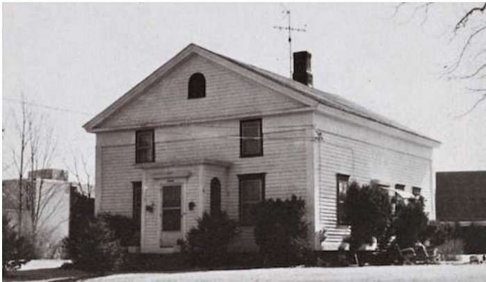
The original Johnstone Town House, built around 1843. It was used for only about thirty years before town offices were moved to Olneyville. Photo by Walter Nebiker, RIHP&HC, 1975.

Providing adequate roads was vital for commerce and personal travel. Colonial roads often followed Indian paths, but to make roads passable by wagons, additional work was required to improve and maintain them. In June of 1765, the first surveyors of highways were elected. By 1772 there were thirteen road districts in the town. The people in each district were responsible for the maintenance of their roads, first through their individual labor and later through taxes. In 1772, two other vital matters were also addressed at town meetings. The first matter was the licensing of taverns, which were very important in the colonists' lives. The second matter involved smallpox, which killed many of our early ancestors. By vote at the September town meeting, inoculation for smallpox was introduced.