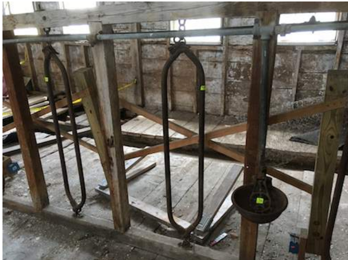
Milking stalls in the barn, remnants of dairying days. August 13, 2020.

[Note: To see more photos of the Mathewson Farm, see the photo album of the same name on our Facebook page. -- ed.]