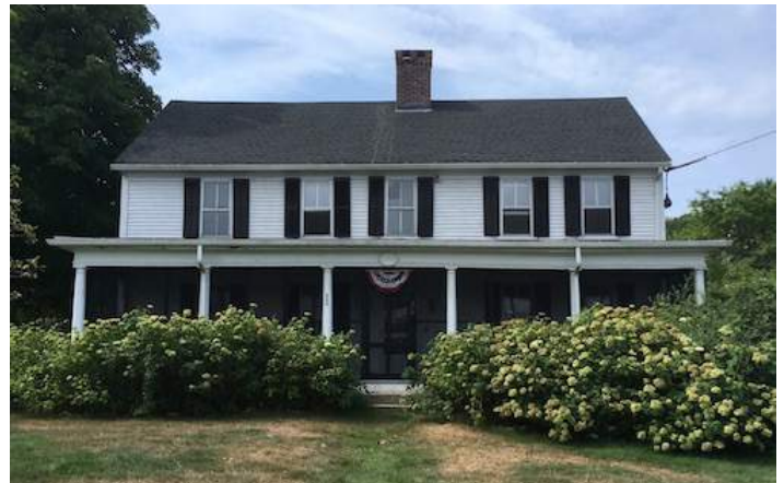
The Mathewson farmhouse.